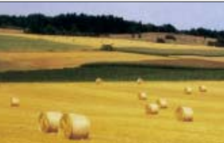
Polywrap Premium round bale nets are regularly adapted to the newest developments in press technology.

Polywrap Premium has an improved spreading characteristic, so that it runs in the complete width of the bale. It ensures an edge to edge (side to side) wrapping on all makes and models of machines and meets the highest requirements. The high net quality ensures a maximal